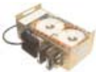
AMPIID/48/PSU/B This is a 2.4Kw A.C. to D.C. converter which carries rectifier sticks to bridge both primary and secondary supplies to an ACE AMPIID power amplification rack. Data sheet PM0003

This enables either AC or DC subsystem to independently energize the equipment unlike a conventional UPS (Uninterruptable Power Supply) system that inverts DC battery voltage to AC mains supply. Use of fully duplicated supplies i.e. Primary AC and Secondary DC to the target equipment enhances integrity and simplifies the power subsystem critical path.