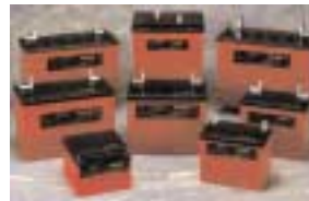
High reliability sealed lead acid accumulators are incorporated in our power systems

Charging is by constant voltage charger type BC0001 which also incorporates supervision of wiring to / from the battery terminals including monitoring of all critical protective fuse links.